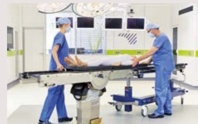
The dedicated table top of the Maquet Magnus Surgical Table supports repositioning-free transfer to the MRI.