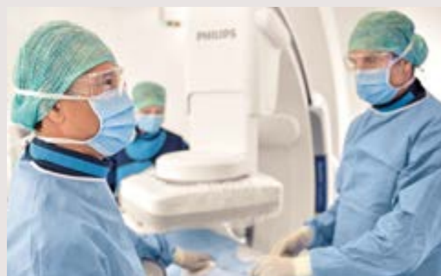
Our versatile product portfolio brings endless possibilities to your Hybrid OR.