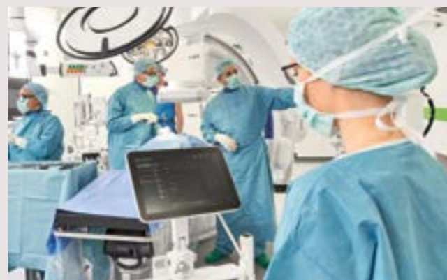
Proper planning plays a crucial role in the development of a multi-disciplinary Hybrid OR suite.