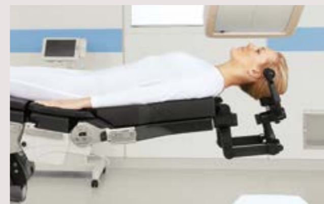
Radiolucent accessories – such as the skull clamp for neuro and spine procedures – are designed for compatibility with intra-operative imaging.