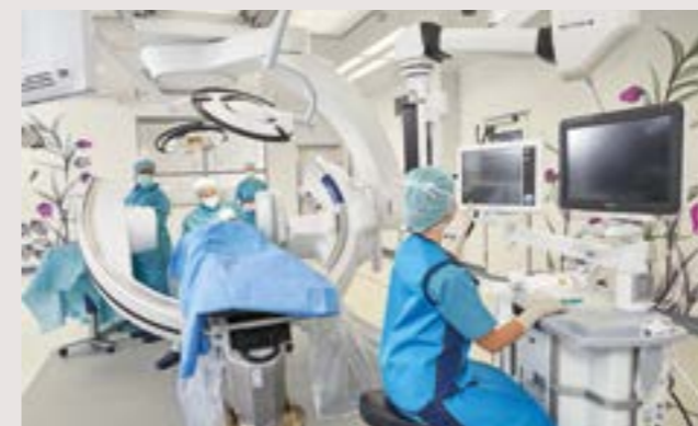
Philips Azurion with FlexArm is the latest angiography system to be fully integrated with the Maquet Magnus Surgical Table.