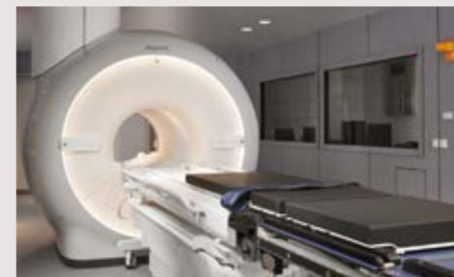
The Maquet Otesus and Maquet Magnus Transfer Table Tops from Getinge are compatible with Philips Ingenua MR-OR, for intra-operative checks or diagnostic use.