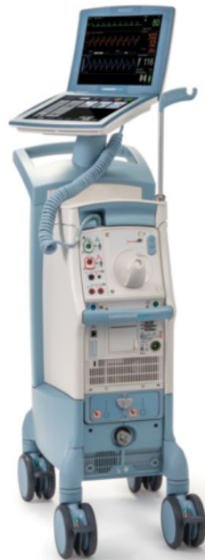
Figure 3: Cardiosave in Hybrid Configuration