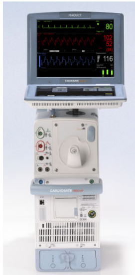
Figure 4: Cardiosave in Transport Configuration

An unexpected shutdown upon battery removal cannot occur for Cardiosave Rescue.